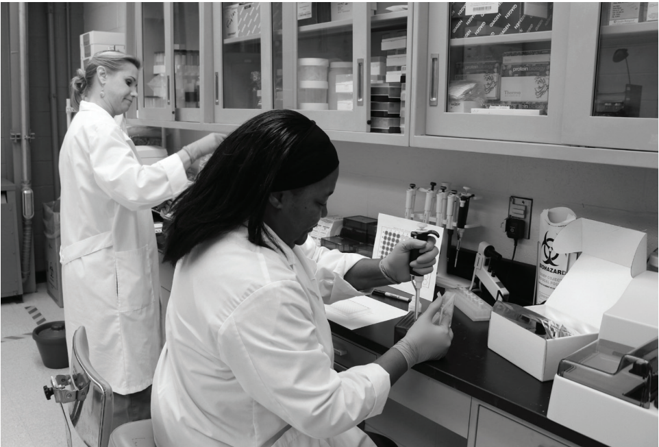
We Discover: The LSU School of Veterinary Medicine investigates a variety of diseases.

The safest and most effective method of preventing rabies in high risk groups is by pre-exposure vaccination. Because the risk of exposure is especially high for students of veterinary medicine, it is the policy of the School of Veterinary Medicine that all students must receive pre-exposure rabies vaccine before or during the fall semester of their first year in the professional curriculum. The vaccine will be available through the LSU Student Health Center for enrolled veterinary medicine students.