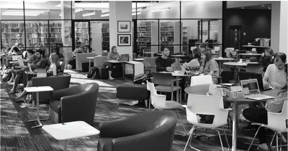
We Teach: The LSU Veterinary Medicine Library is accessible 24/7.

All fees are estimates and the LSU Board of Supervisors may modify tuition and/or fees at any time without advance notice. Check current tuition and fees at www.lsu.edu/bgtplan/Tuition-Fees/fee-schedules.php .