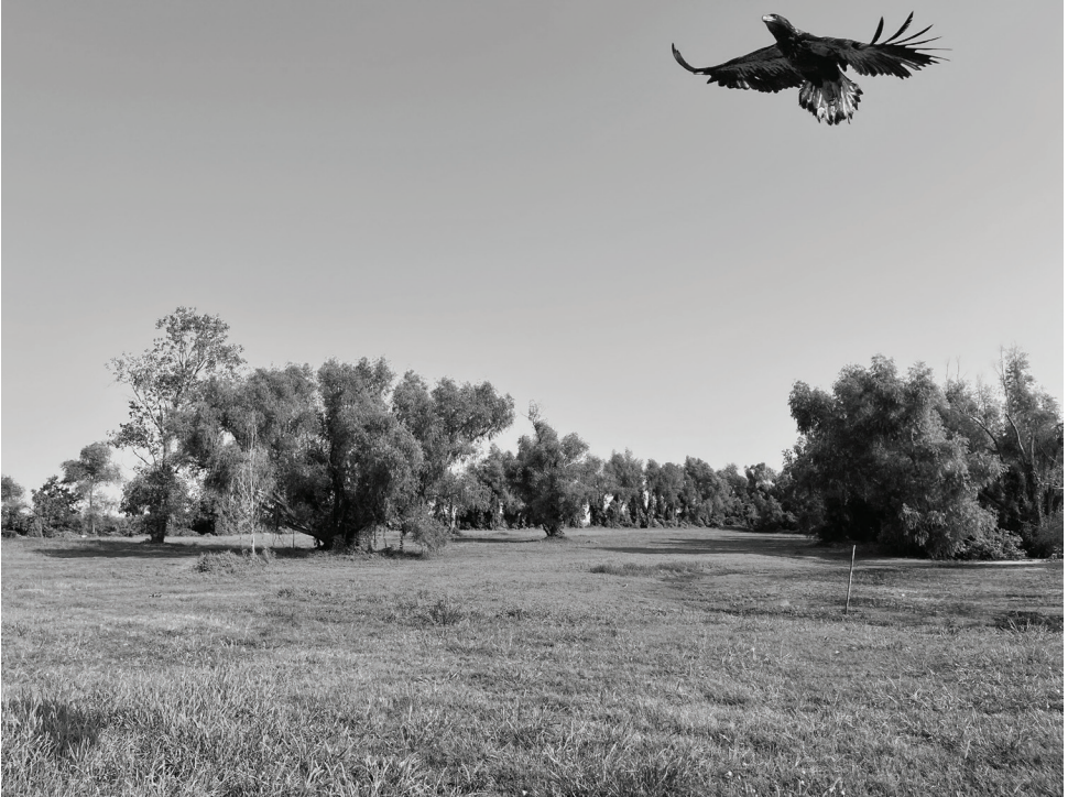
With approximately 1,600 animals brought to the LSU Vet Med Wildlife Hospital of Louisiana each year and a release rate of about 75 percent, we are able to give back to Louisiana and beyond when we are able to get our wildlife patients back home. Here a juvenile bald eagle is released near the Mississippi River in Baton Rouge.