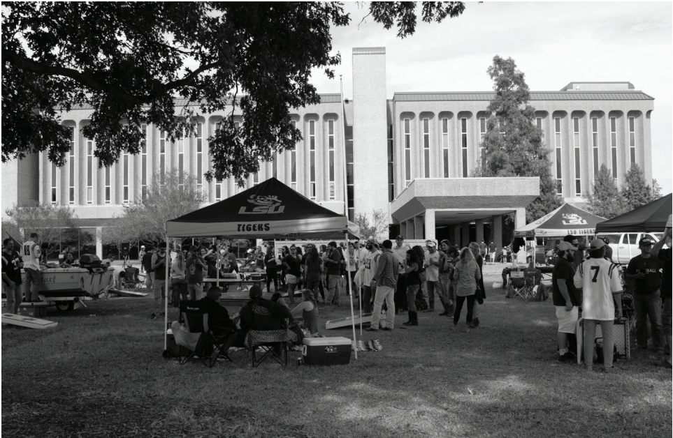
Fall in south Louisiana means LSU Tiger football and tailgating.

The Department of University Recreation provides a variety of recreational activities. To meet the diverse needs and interests of the University community, a multifaceted recreational program is offered that includes aquatics, informal recreation, healthy lifestyle programs, intramural sports, adventure recreation, sport clubs, and special event activities. For additional information, contact the Department of University Recreation.