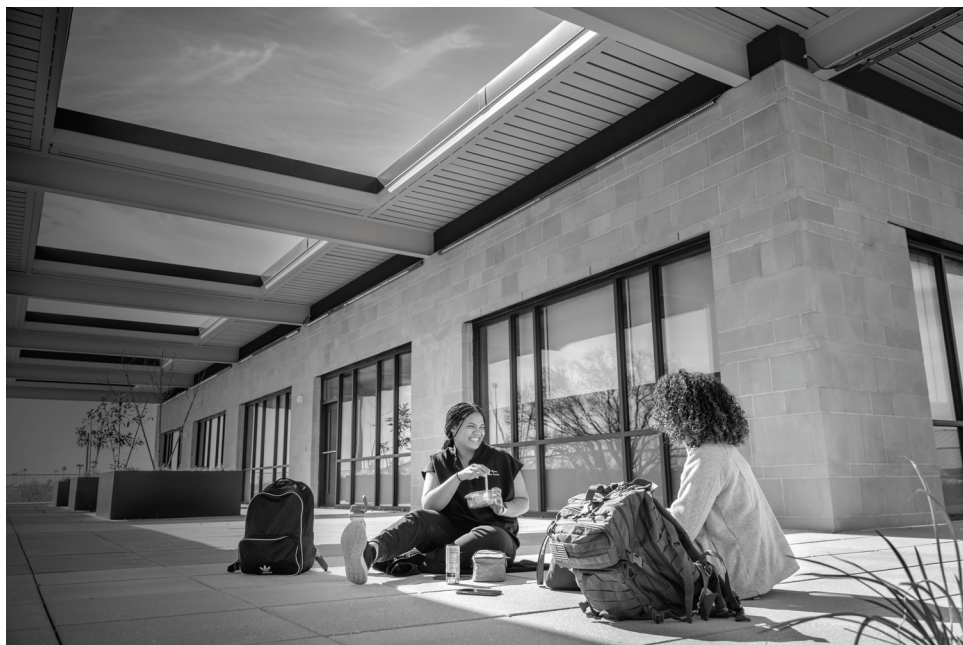
The Stephenson Pet Clinic Terrace is a great place to hang out, study, visit with friends, and enjoy a great view.