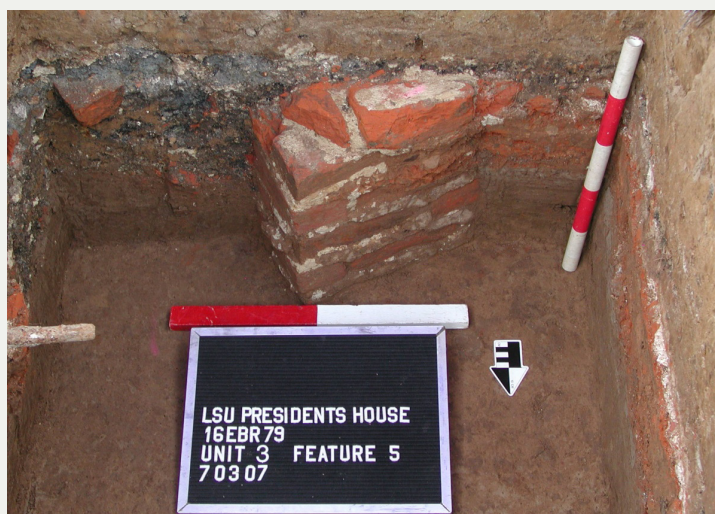
Feature 5, Brick pier for column support. Right: Feature 7, polygon-shaped foundation of well house.

In conclusion, our excavations at the location of the Old LSU President's Residence revealed the presence of intact archaeological deposits and structural features interpreted as being related to the structures known to have been present in this location since at least 1829. Future excavations may shed additional light on the daily lives of the soldiers, officers, cadets, students, workers, and administrators who served, studied, lived, and toiled here during both the military and LSU occupation of the Louisiana State Capitol Grounds.