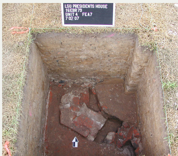
Feature 7, polygon-shaped foundation of well house.