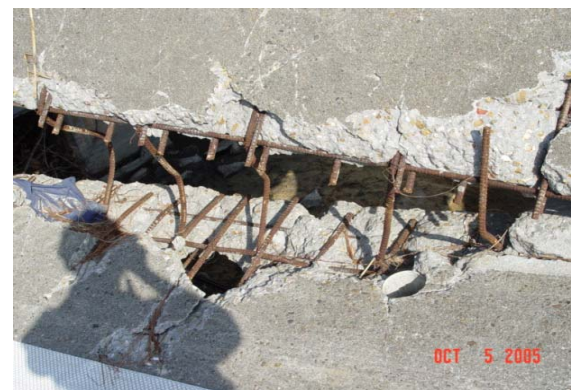
Many failures revealed bad detailing.