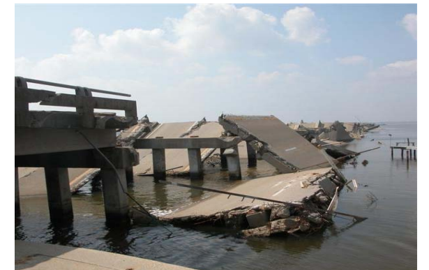
Damage to US 90 (St Louis Bay, MS)