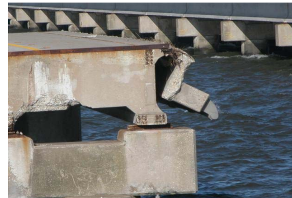
Damage to I-10 (twin span near New Orleans, LA)