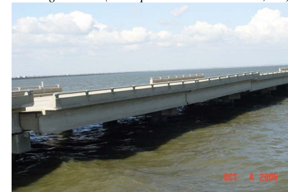
I-10 looking from south towards Slidell. Note that the span shifted towards east because the bridge is located on the left side of the hurricane eye.