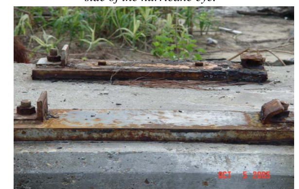
Typical bearing failure due to the lateral shear.