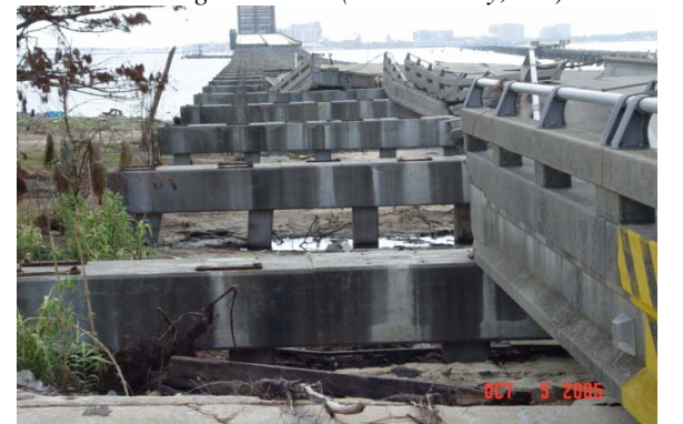
US-90 looking from Ocean Spring towards Biloxi. Note that all span shifted towards the west (opposite to the I-10 bridge) since the bridge is located on the right side of the hurricane eye.