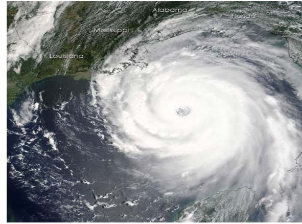
Hurricane Katrina approaching New Orleans as a Category 5 storm.

Research efforts by the LSU Hurricane Center and partners provided support to the state of Louisiana in many ways throughout Hurricane Katrina, August 29, 2005. These ranged from mitigation prior to the storm, operational support and response during the storm and follow-up research & damage assessment post-Katrina. Researchers within the Hurricane Center are currently involved in recovery and rebuilding of a more hurricane-resistant coastal Louisiana and city of New Orleans.